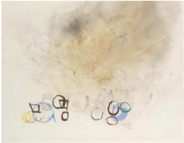
10 Stones , 1989

Colour soap ground aquatint and spit bite aquatint on smoked paper © The John Cage Trust