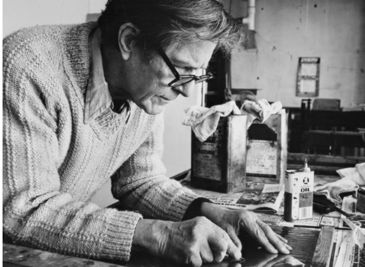
Cage engraving at the Crown point Studio, 1982

John Cage (1912 - 1992) is one of the most important artists of the 20 th Century. A self-proclaimed polymath Cage was engaged in a broad range of activities including music, visual arts practices, writing, teaching and even mycology (the study of mushrooms) - he once claimed that this was because it was next to music in the dictionary! In presenting a lesser known aspect of Cage's oeuvre, Every Day is a Good Day encourages a wider look at the artist's output. This broadens our understanding of his work, his personality and most importantly his legacy as one of the most important cultural figures of the 20th Century.