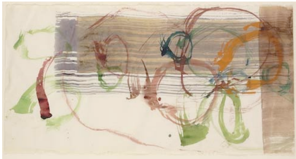
New River Watercolour Series II, No.1, 1988 Watercolour on paper

In the series Where R=Ryoanji Cage drew around stones that were scattered (according to chance) across the paper or printing plate. In one case he drew around 3,375 individually placed stones. The art critic David Sylvester described these as, 'among the most beautiful prints and drawings made anywhere in the 1980s'.