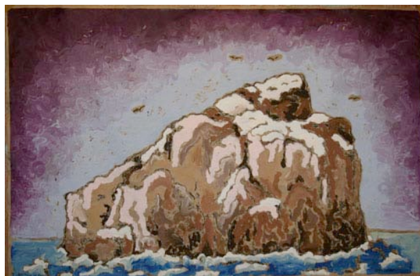
Bastion of Empire (Caramel Coffee Creme), 2009