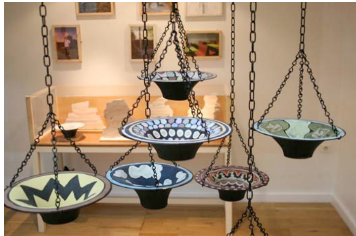
Pessimism of the Intellect, Optimism of the Will

“In general I employ a highly subjective approach as a methodology, using personal starting points to attempt to open up much more general questions, using myself and my subjectivity as a microcosm to attempt to approach something much bigger than myself.” 3