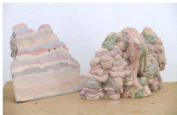
Stalagmites (A Series of Small Encounters)

Holden's work frequently draws out the relationship between artifact and artifice, between the authentic and the fake. His stalagmites are totemic, organic structures. Created through the laborious process of dripping coloured plaster, each layer takes one hour to form and set before the next can be applied. For Holden, these sculptures are the manifestations of studio time – the slow building up of an idea, the thought processes which happen in the studio. Here the forms reveal the time of their own construction. They are authentic and honest; the nature of the material dictates the time it takes to construct.