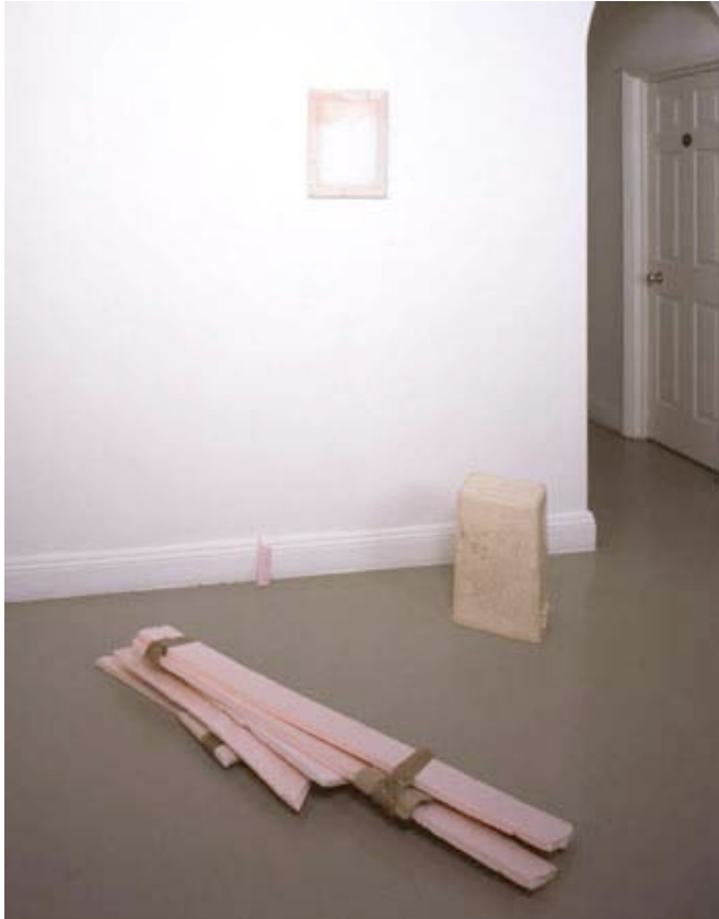
Wittgenstein Project/Skolgen (2003)