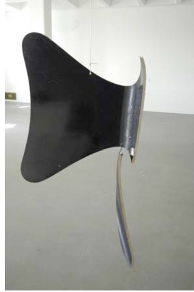
Details of Suspended Fall, 2005

Boyce draws on 20 th century design and urban architecture, rather than the visual arts, for inspiration. For the work in the exhibition, he purchased Arne Jacobsen chairs over e-Bay then carved, sawed and reassembled them to create mobiles that are a playful echo of the work of Alexander Calder.