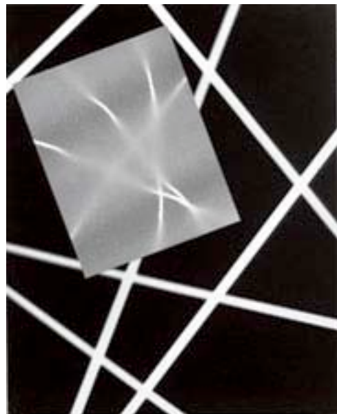
Light Drawing, 1978