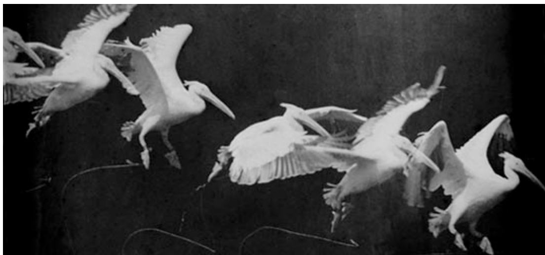
Flying Pelican , photographed by Étienne-Jules Maray, 1882

2: 'They were a trace of where the body has been'