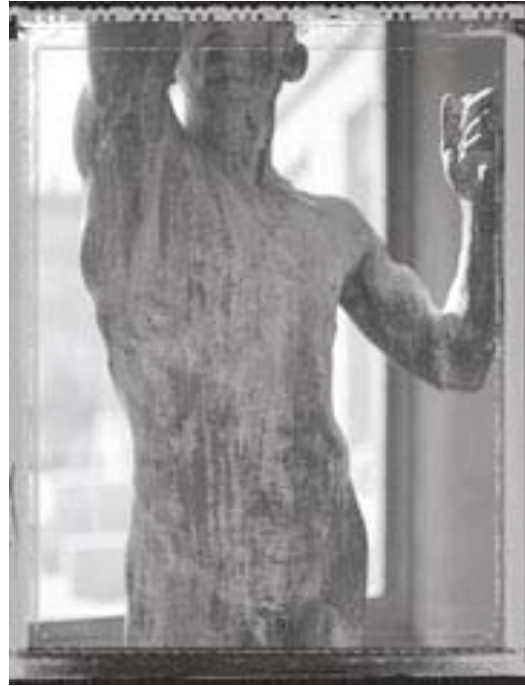
Casting the Die (Rodin)