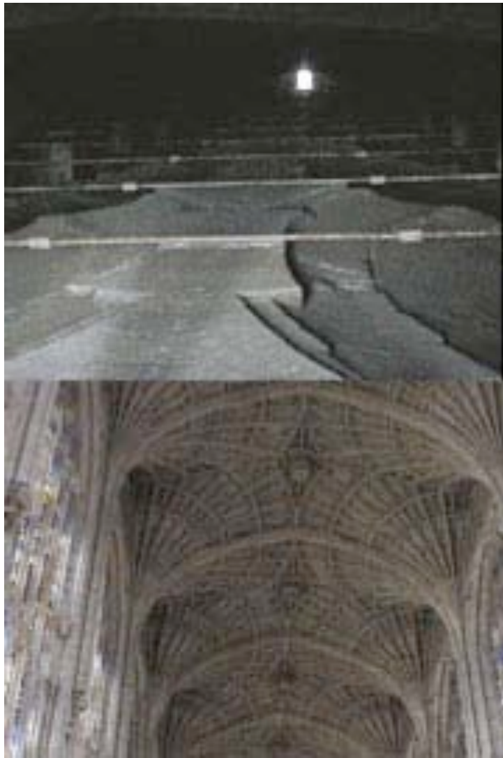
The Analysis of Beauty Still