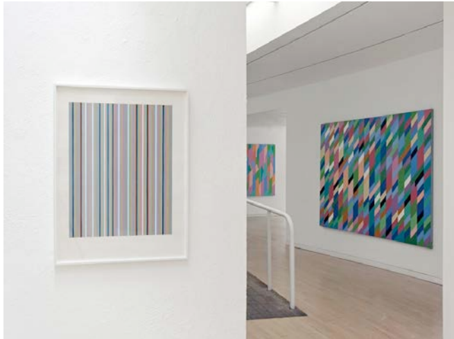
Installation view, Bridget Riley: stripes, planes and curves