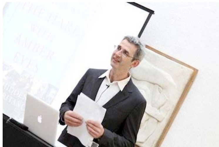
Edmund de Waal talk, 23 May2012

This year saw the development of new digital ways to engage with Kettle's Yard. We began live streaming of regular lunchtime talks via speaker and bambuser and all talks are now archived and can be accessed here: http://www.kettlesyard.co.uk/live/ . We continue to use issuu to publish our print online.