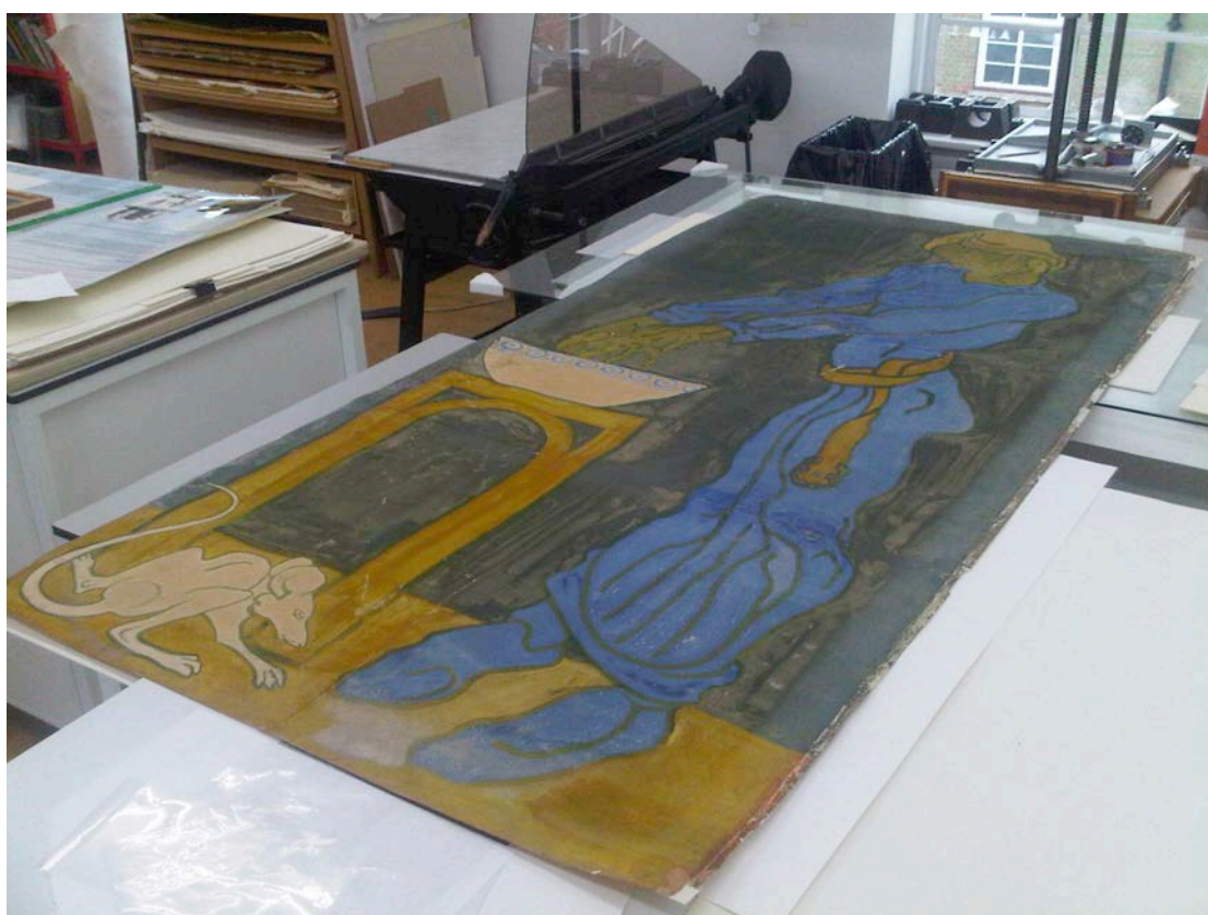
Conservation underway on Lady Macbeth in the Museum Conservation Services studio, June 2012