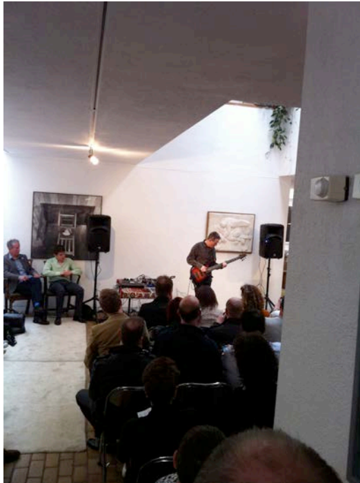
John Paul Jones at Kettle's Yard