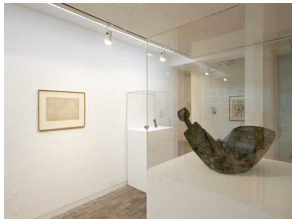
Installation view, Henri Gaudier-Brzeska: Vorticist!

January saw a new programme of capsule exhibitions in reduced gallery spaces. This exhibition ran for 12 weeks, with a total of 6,698 visitors. This display was the first of a series of Artist in Focus displays conceived as spotlight shows looking at familiar artists and individual works in the Kettle's Yard Collection in some depth. Henri Gaudier-Brzeska: Vorticist! was very well received by audiences: "Small, but perfectly framed. So glad I managed to get here before Gaudier-Brzeska closed, and will be back to see the other small shows. Really enjoyed seeing in depth in the collection- e.g. 'bird eating fish' sculpture with the sketch and ink drawing. Thank you!"