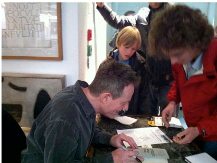
John Paul Jones at Kettle's Yard