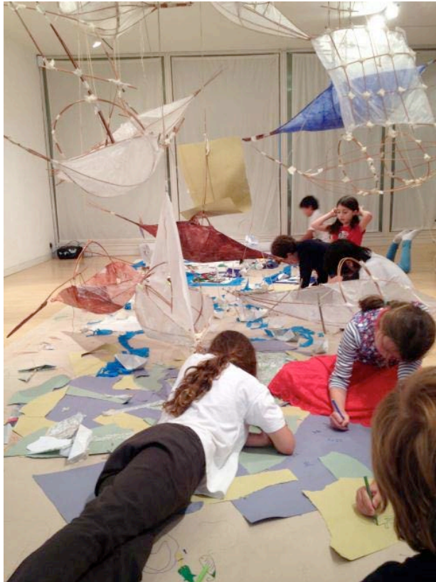
Wednesday Club at Kettle's Yard