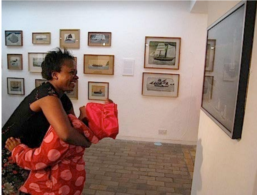
Children Take the Lead, a collaborative interpretation project with Cambridge Curiosity and Imagination and Wysing Arts Centre, Bourn.

The Children Take the Lead project, run in partnership with CCI and Wysing Art Centre and funded by ACE, worked with Spinney Primary School and invited families to trial new ways of engaging with contemporary art. 5 'props boxes' have been created. Final evaluation to be conducted in October 2012.