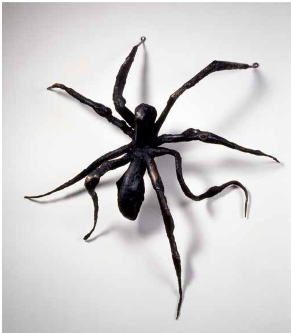
Louise Bourgeois Spider I 1995 Collection The Easton Foundation