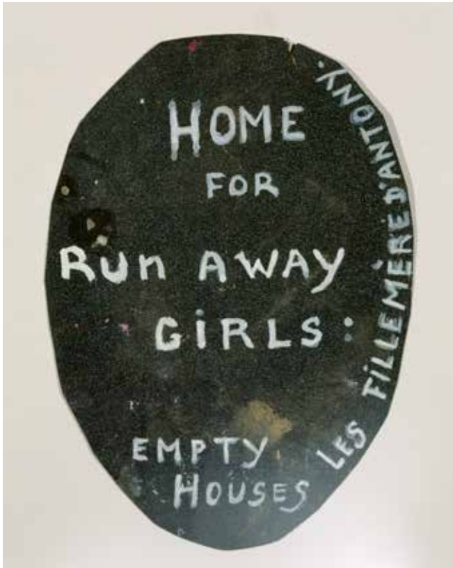
Louise Bourgeois Home for Runaway Girls 1994 Lent by Artist Rooms Foundation

The British artist Tracey Emin (born 1963), who collaborated with Bourgeois on a series of prints in 2009-10, also has an autobiographical element to her work. The Family Suite 1994 in the National Galleries of Scotland's collection is a deeply personal series of prints recalling Emin's childhood in Margate.