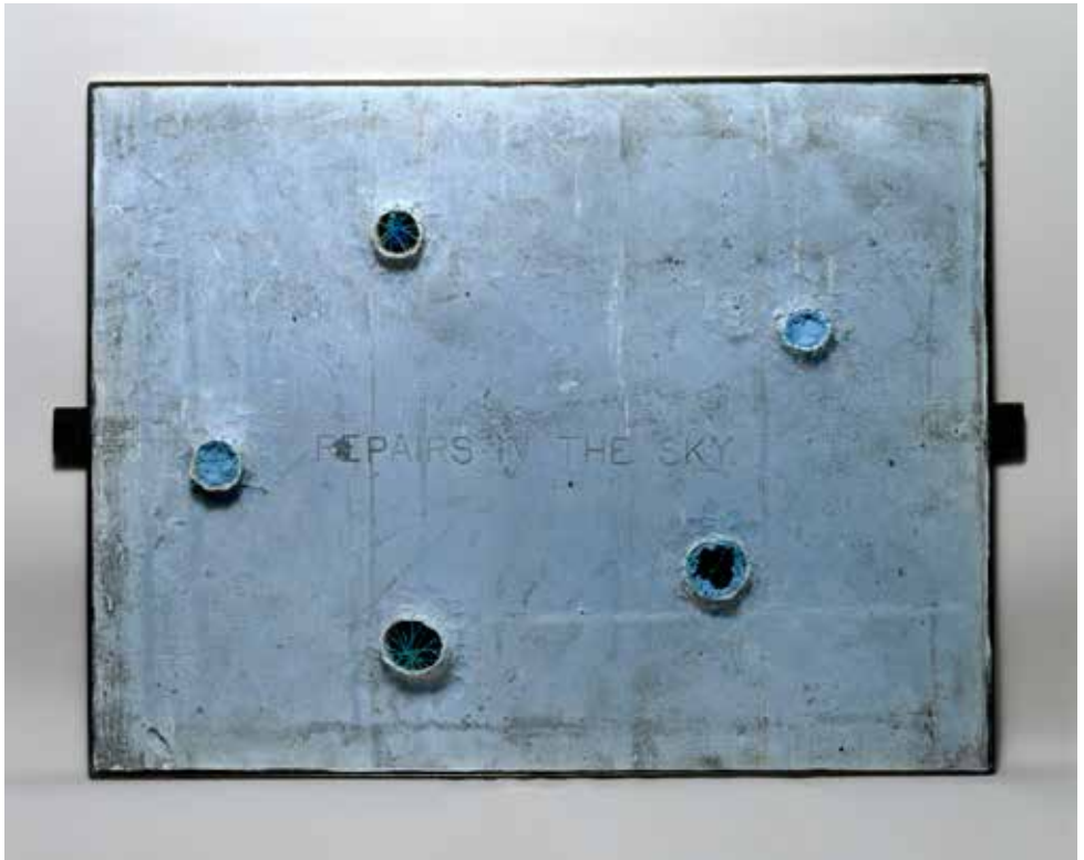
Louise Bourgeois Repairs in the Sky 1999 Lent on behalf of the Artist Rooms Foundation