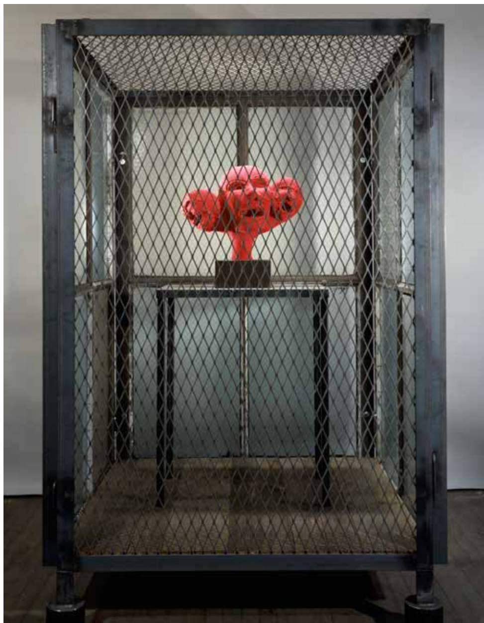
Louise Bourgeois Cell XIV (Portrait) 2000

ARTIST ROOMS Tate and National Galleries of Scotland. Lent by the Artist Rooms Foundation 2011