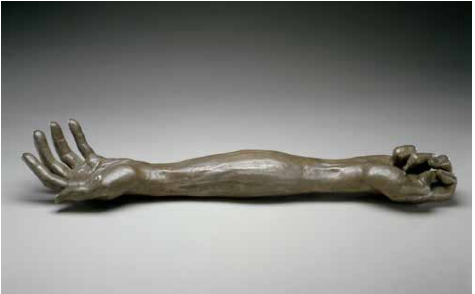
Louise Bourgeois Give or Take 2002

Bill Viola (born 1951) explores universal human experiences such as birth, death and the unfolding of consciousness. In the work Four Hands 2001 the hands of three generations are seen in this work – a young boy, father, mother and grandmother – using hand gestures that accompany emotional states.