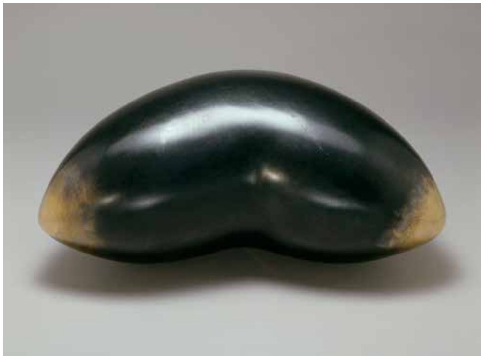
Louise Bourgeois Tits 1967

ARTIST ROOMS Tate and National Galleries of Scotland. Lent by the Artist Rooms Foundation 2011