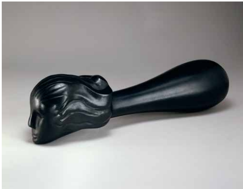
Louise Bourgeois Fallen Woman 1981 Lent on behalf of the Artist Rooms Foundation