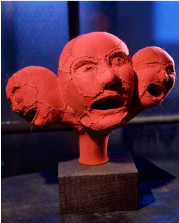
Louise Bourgeois Detail of Cell XIV (Portrait) 2000 Collection Artist Rooms Foundation

The American artist Bruce Nauman (born 1941) has also worked in a vast range of media. Like Bourgeois he also studied mathematics prior to art and his practice can be seen as an open-ended enquiry into the stuff of the world, its materials, the body, language and emotions.