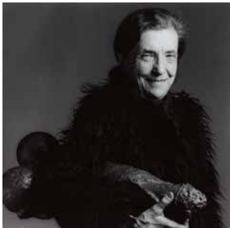
Louise Bourgeois 1982 ARTIST ROOMS Tate and National Galleries of Scotland. Acquired jointly through The d'Offay Donation with assistance from the National Heritage Memorial Fund and the Art Fund 2008

Bourgeois's first European retrospective in 1989 was organised by the Kunstverein in Frankfurt; the same year she began to make her Cells. The Cells, typically constructed from a mixture of salvaged architectural materials such as old doors, windows, wire mesh and glass panes combined with found objects and sculptural fragments, would become an important part of her artistic production during the remainder of her life. In the mid 1990s Bourgeois began to work with textiles, including old garments, primarily her own and those of her mother, that she had saved for many years. Imagery relating to