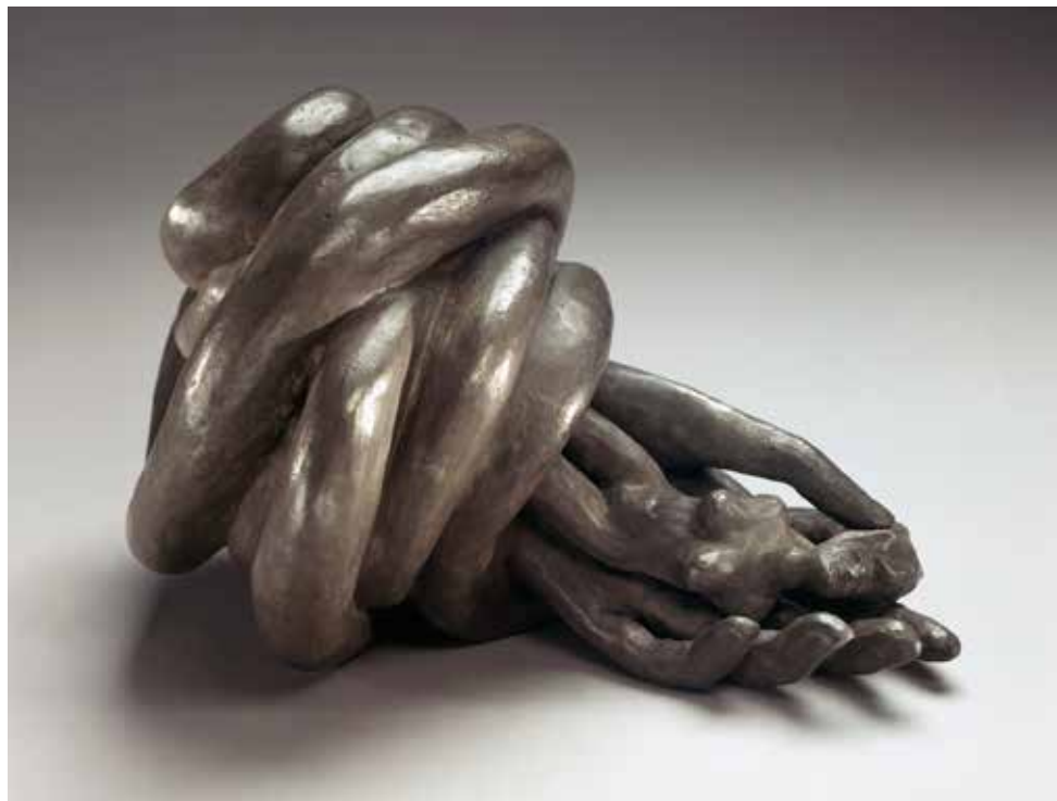
Louise Bourgeois Nature Study 1986 ARTIST ROOMS Tate and National Galleries of Scotland. Lent by the Artist Rooms Foundation 2011